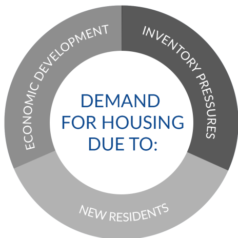
Boise Metro Population Trends and Estimated Growth